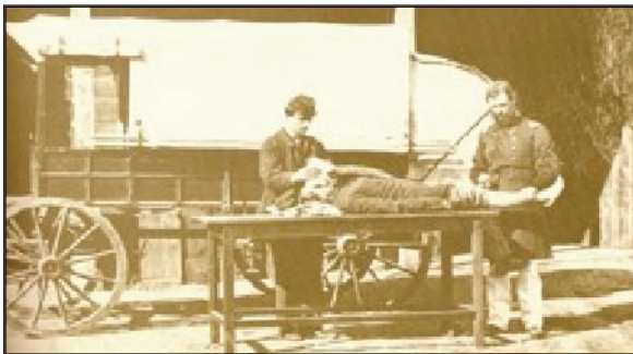
Staged photo of a supposed amputation with a Union ambulance in the background

number one cause of death was very simply the cholera and dysentery that men got from drinking tainted water. Experts had no idea about the bacteria in the water, then had no effective drugs to combat such diseases when they took hold.