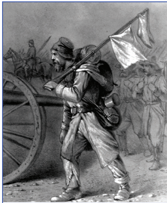
WASHING DAY, COLUMN ON THE MARCH, 5 May 1865. Detail of a period drawing by Edwin Forbes, Library of Congress.